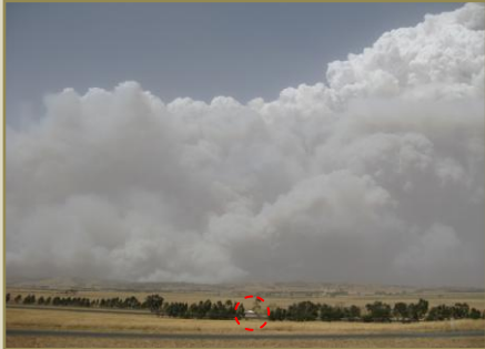
A frightening view (above) of the smoke cloud billowing along the fire frontline as it headed south east from Kilmore, advancing on Kinglake West at speeds estimated at more than 100 kmh. Circled is a car fleeing the area, putting the terrifying magnitude of the blaze into perspective.