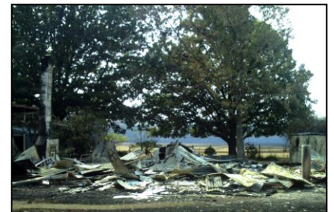
Green trees, virtually untouched by the fire, surround Keith's Glenburn property.