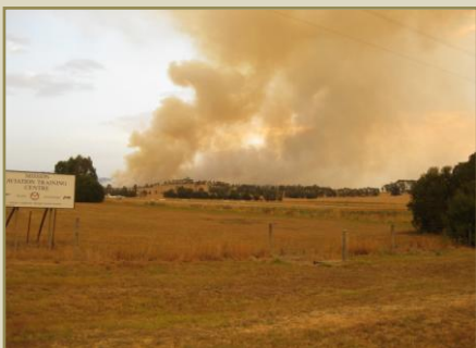
Smoke gathers above the Lilydale Airfield from the fires surrounding Yarra Glen (above). Aided by high winds, extreme heat and tinder-dry ground conditions, the fire posed an immediate threat to all the towns in its path. Ember attacks created isolated spot fires ahead of the main front, taking many residents and fire crews trapped between by surprise.